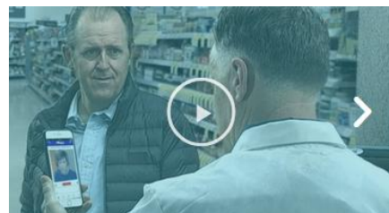
Trip to the Pharmacy is about a gentleman requesting help in real-time