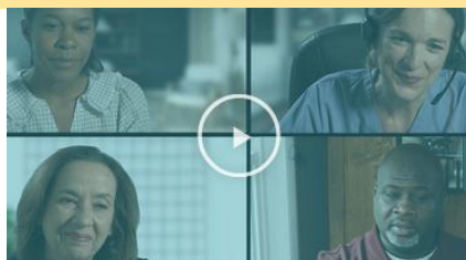
A whole team shows how we tie together all the different aspects of medical care