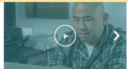
Referral to a cardiologist demonstrates how we never simply hand a patient off and send them “into the system”