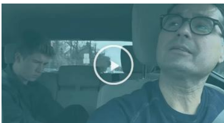
ER Vignette is another story of avoiding an unnecessary ER visit