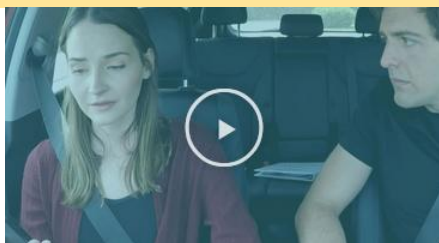
Trip to the ER is about a women being unnecessarily directed to the ER by her OB's office

What we provide for our members is best illustrated by these real patient reenactments.